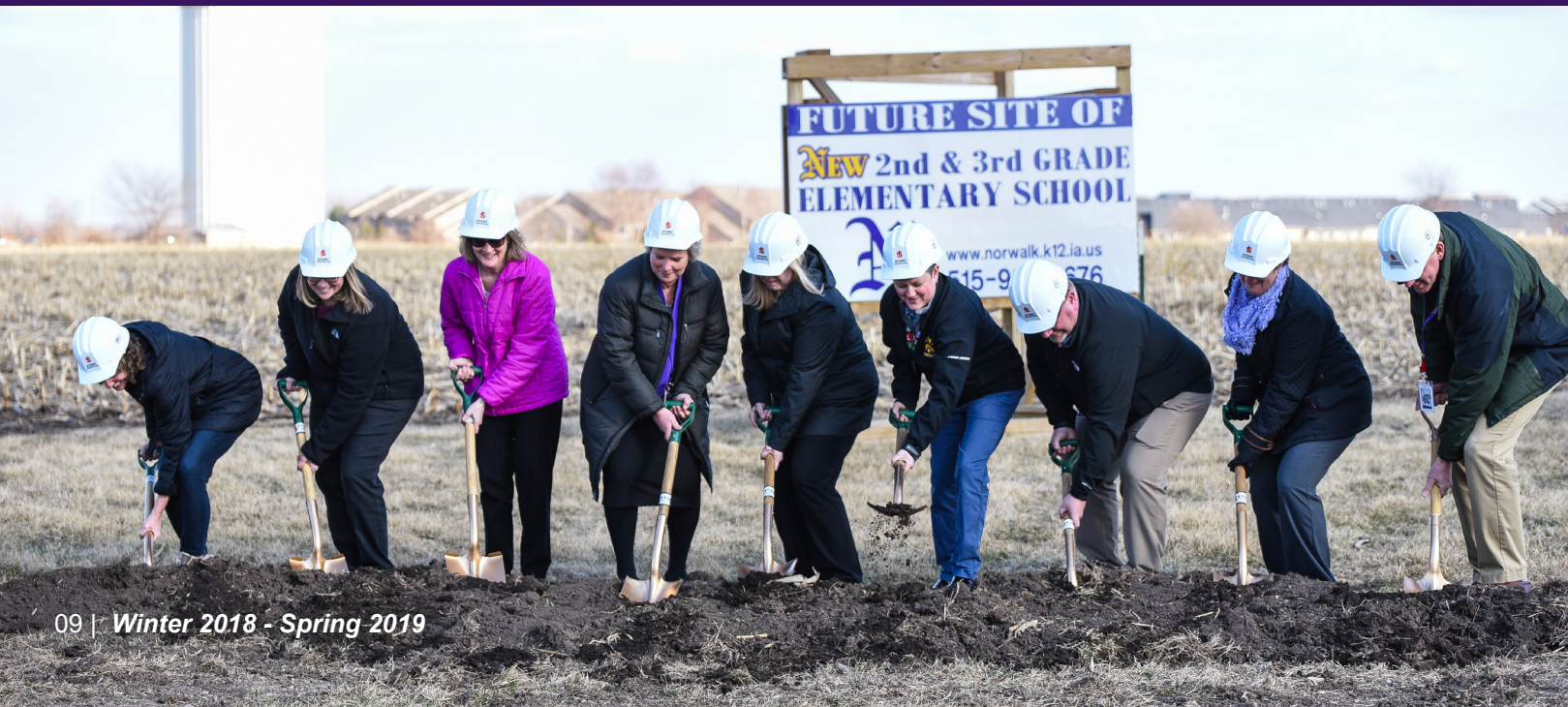
Student Enrollment Increase

The District has commissioned RSP to refresh the enrollment projections this year using the 2018 fall data. The graph illustrates "resident" enrollment, meaning students that reside within the Norwalk District. The enrollment numbers listed in the chart represent the total students "served" (resident students plus open enrolled students) in the Norwalk District. This type of enrollment increase means the District will need to accommodate 4-5 more classrooms every year. The Board of Directors has established a long-term facilities plan to meet this expected growth trend. With the anticipated rapid growth scheduled for Norwalk Schools, facility and operational planning has become an ongoing process to keep ahead of this curve.