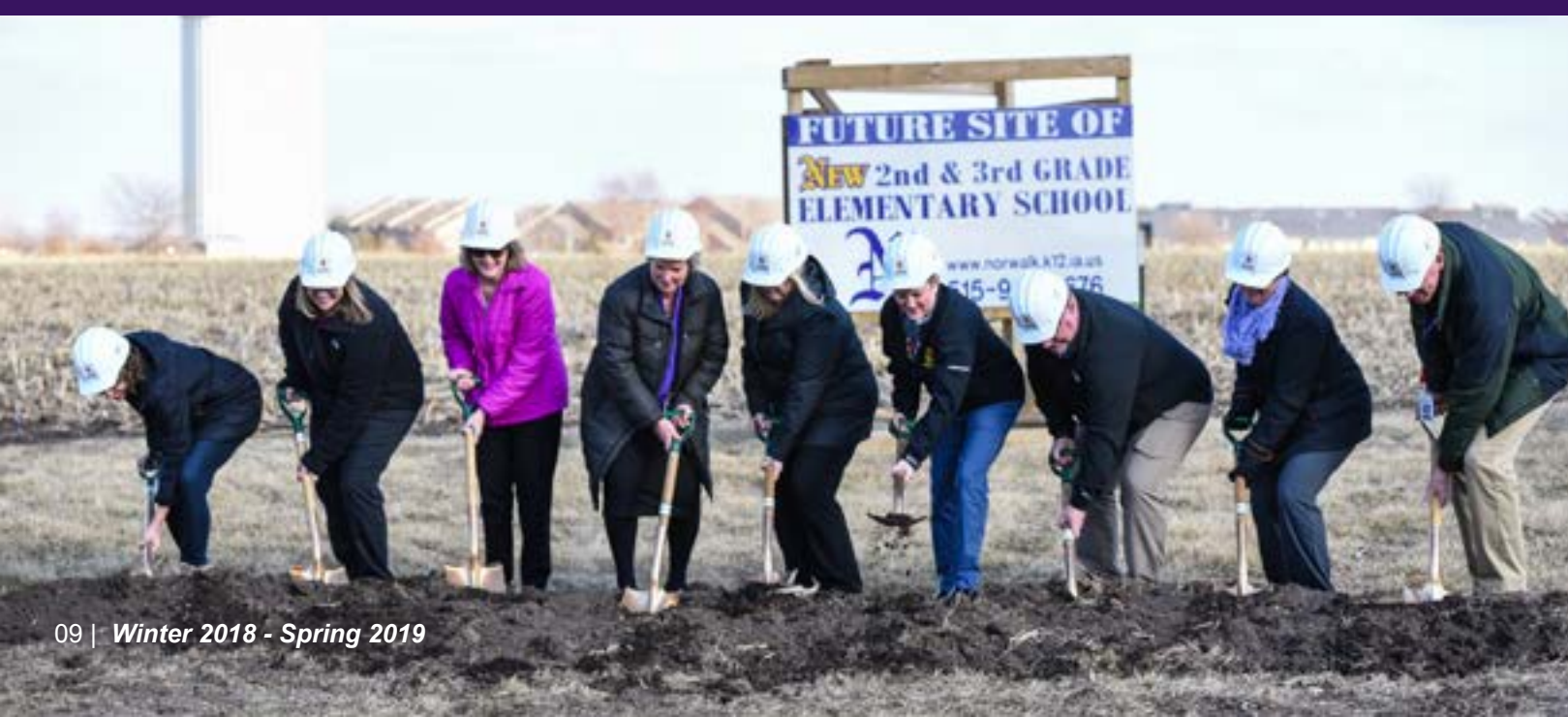
Student Enrollment Increase

The District has commissioned RSP to refresh the enrollment projections this year using the 2018 fall data. The graph illustrates "resident" enrollment, meaning students that reside within the Norwalk District. The enrollment numbers listed in the chart represent the total students "served" (resident students plus open enrolled students) in the Norwalk District. This type of enrollment increase means the District will need to accommodate 4-5 more classrooms every year. The Board of Directors has established a long-term facilities plan to meet this expected growth trend. With the anticipated rapid growth scheduled for Norwalk Schools, facility and operational planning has become an ongoing process to keep ahead of this curve.