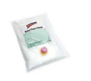
Scotchgard<sup>™</sup> Floor Protection Products