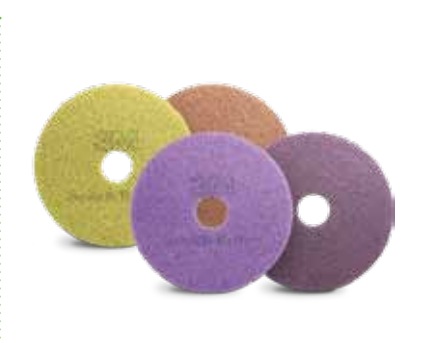
3M<sup>™</sup> Floor Pads

3M's effort to reduce its own footprint is just part of our commitment to environmental stewardship. As part of the 3M<sup>™</sup> Cleaned Green Program, 3M Building and Commercial Services Division also offers you a wide selection of cleaning and maintenance products and tools that help you reduce your impact on health and the environment. These solutions are designed to support your environmentally preferable cleaning efforts.